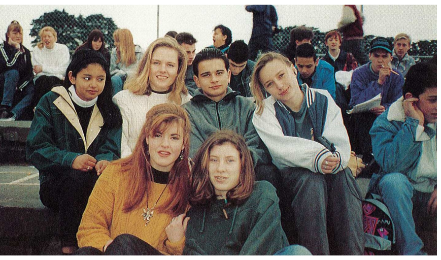
School Life 1993