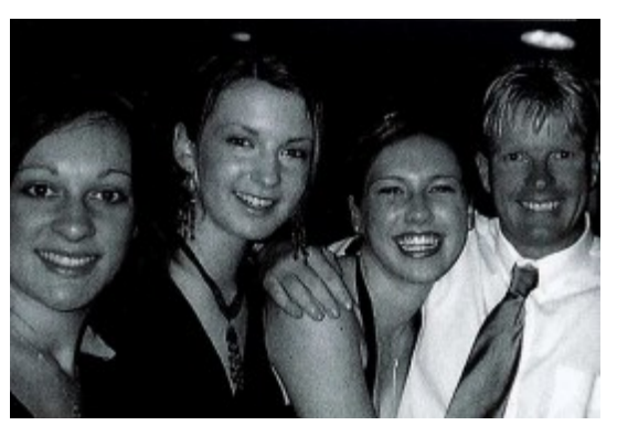
Year 12 2003

Page 5 Alumni Monthly Newsletter Issue 9 - October 2023