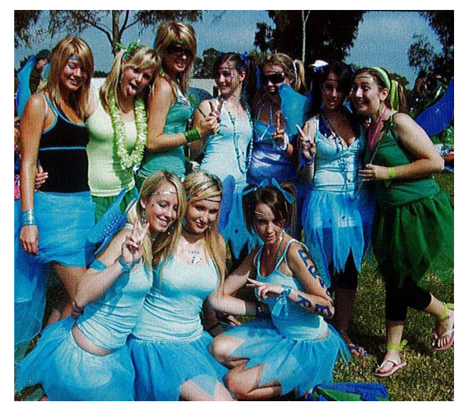
Seniors poolside 2006