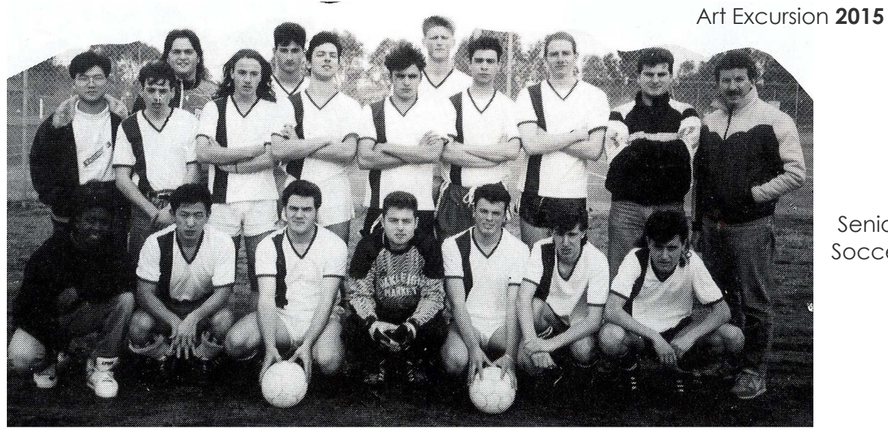
Senior Boys Soccer 1991