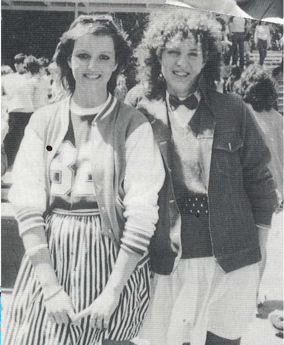
School Life 1983