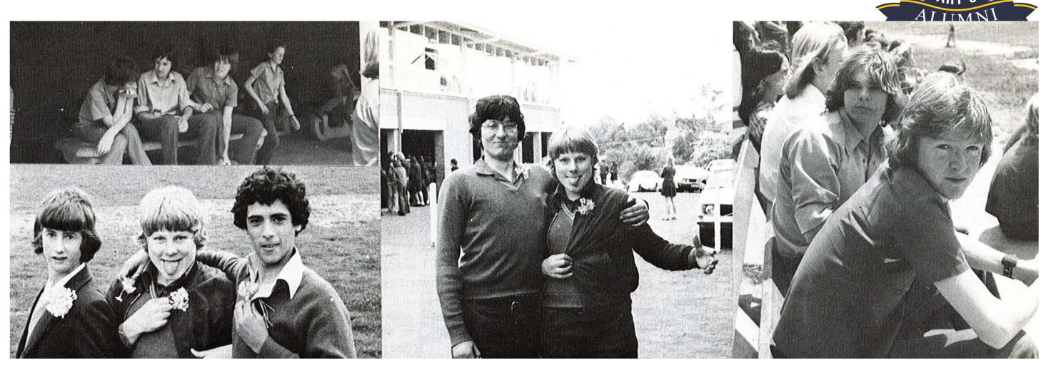
Unicorn Yearbook Pages 1978