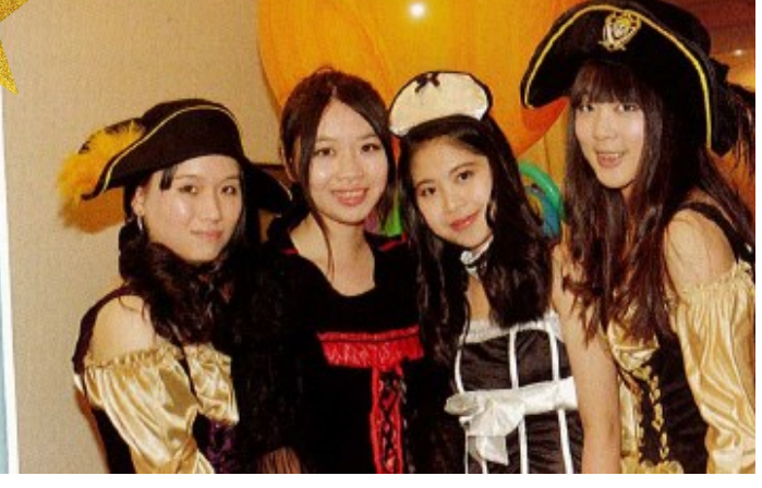
Year 11 Fancy Dress 2013