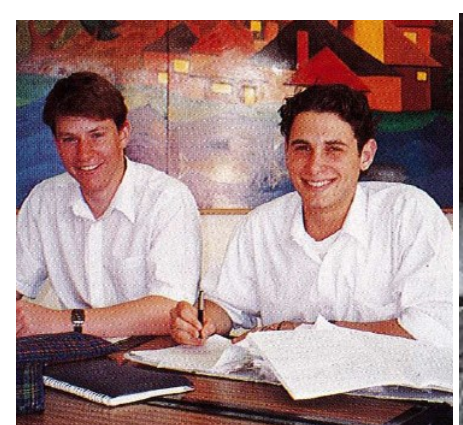
Year 12 1994