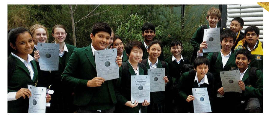
Year 7 da Vinci Decathlon 2012