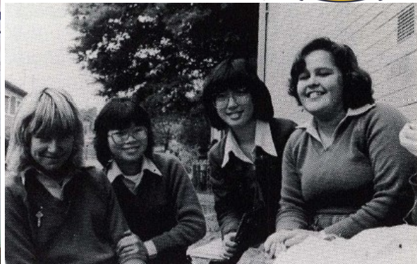
School Life Year 7 1982.