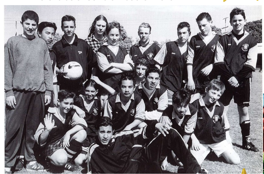
Year 8 Boys Soccer 1998