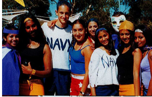
— Sports Day 2003