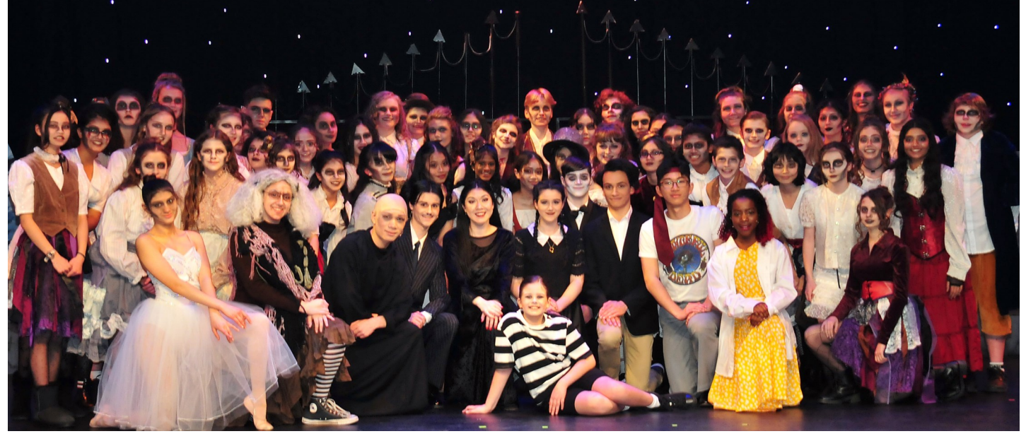
School Production "Addams Family" 2019

Alumni Monthly Newsletter Issue 6 - July 2023 Page 5