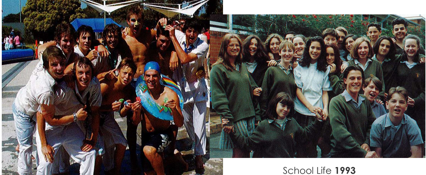
Seniors poolside 2006