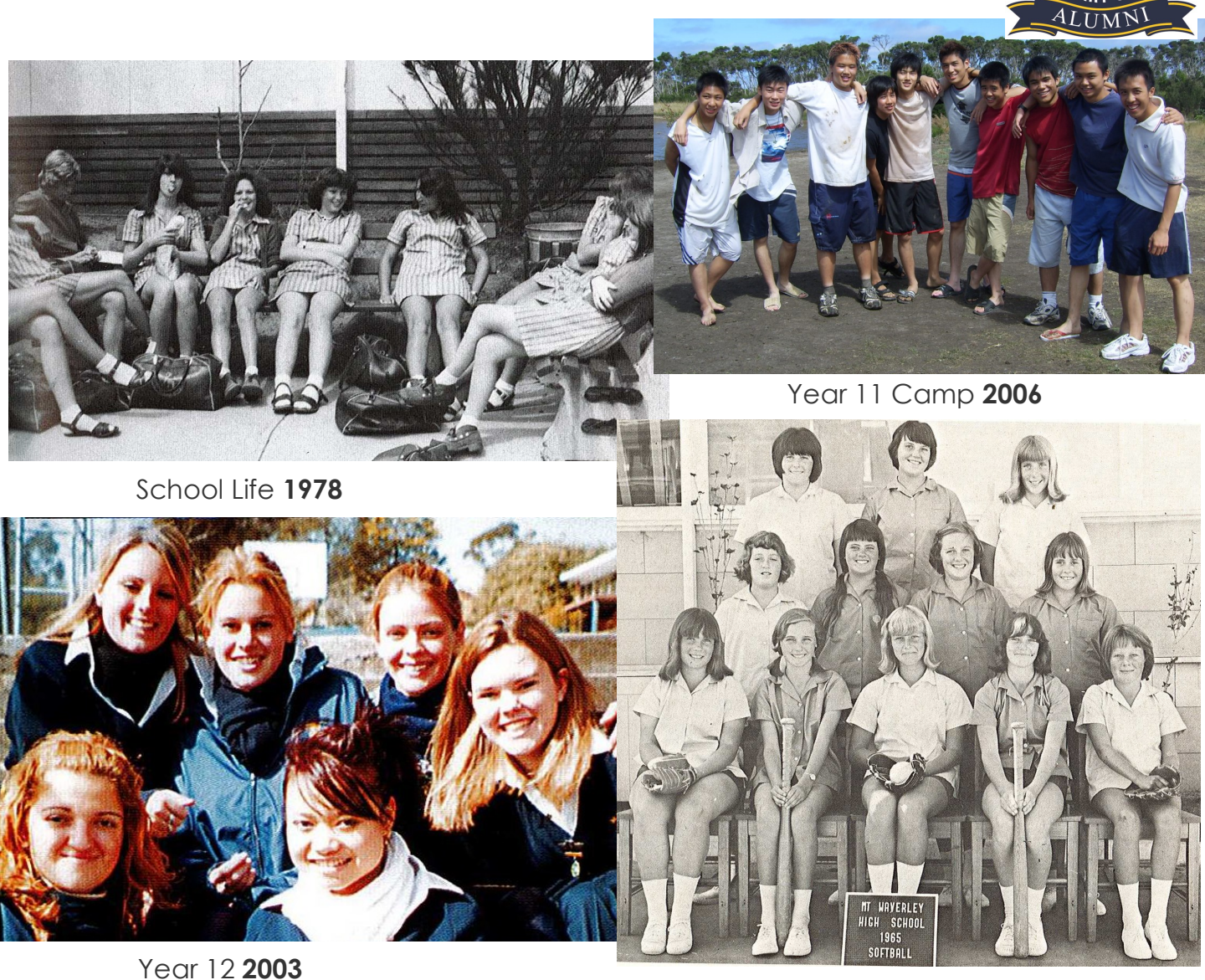
Softball Team 1965