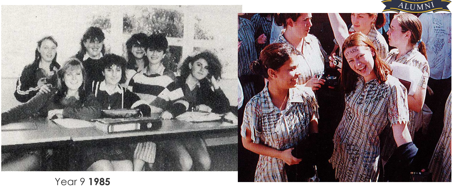
Vale Year 12 2000