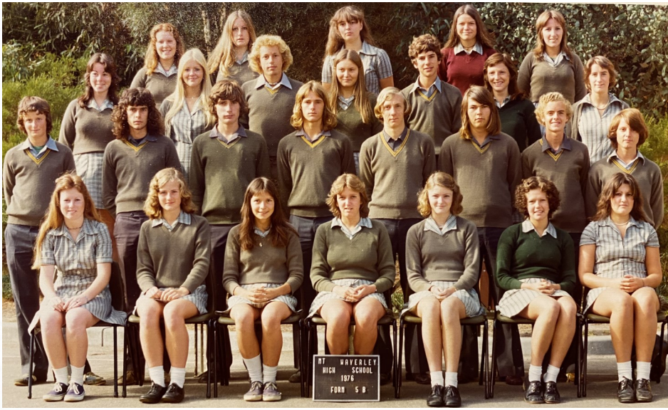
Form 5B 1976