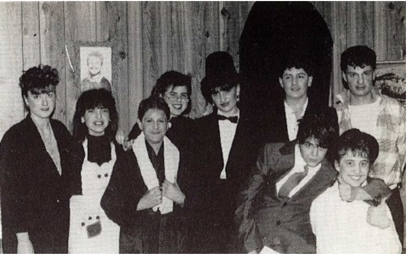
School Production "Fool and A Half" 1988