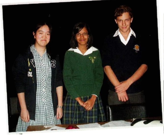
Debating Team 2012