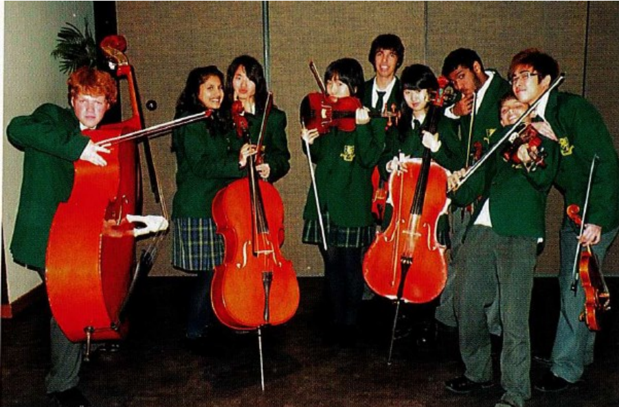
Octetata having fun 2009