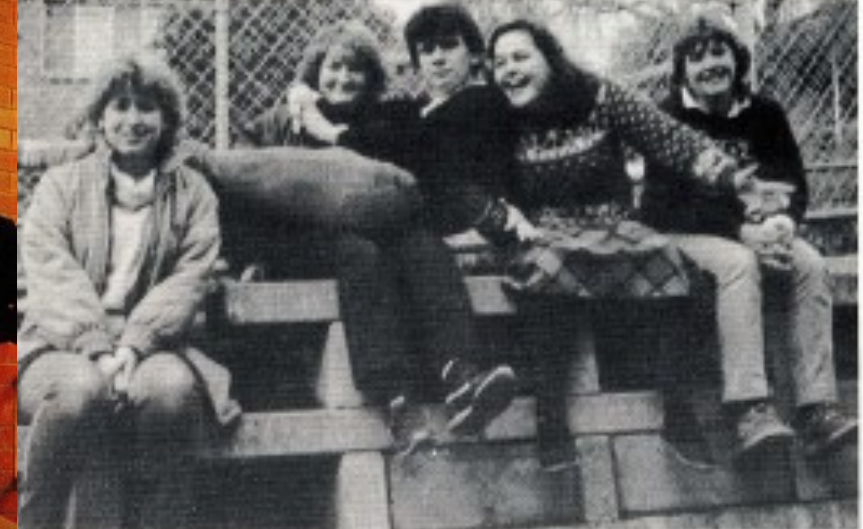
School Life 1991 Year 12 1984

Issue 4 - September 2022 Alumni Monthly Newsletter Page 5