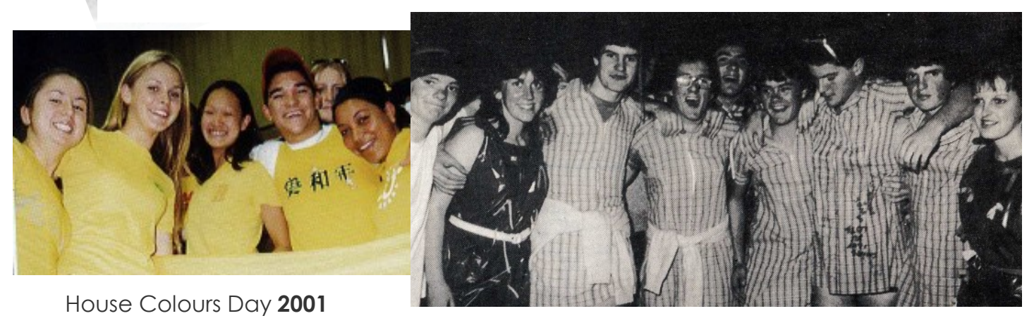
School Dance 1984