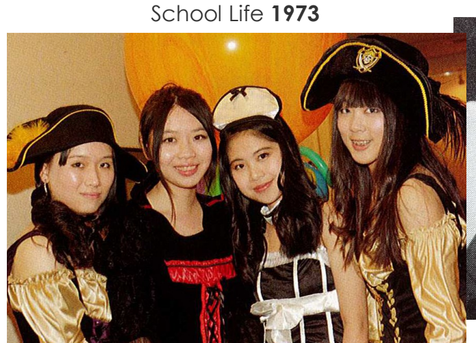
Year 11 Fancy Dress 2013