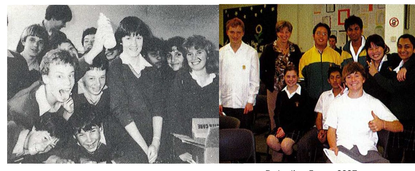
Year 8 1985