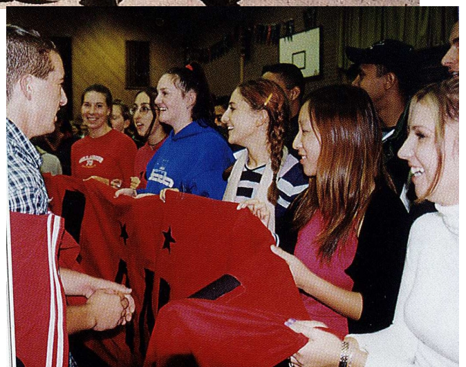
House Colours Day 2001