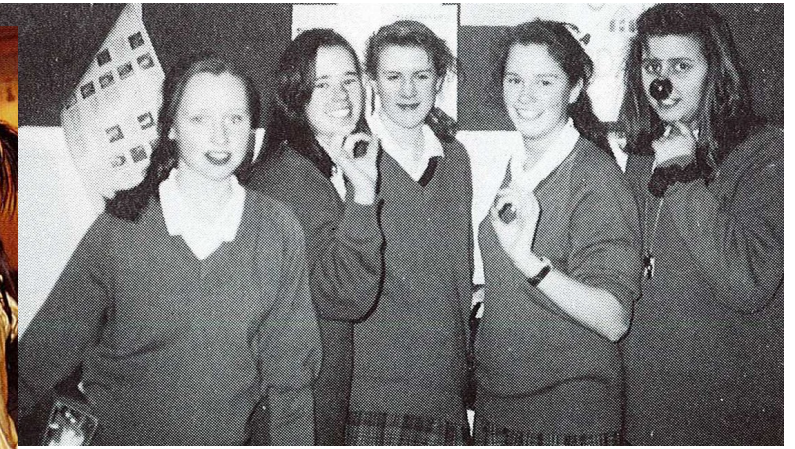
Year 10 1990