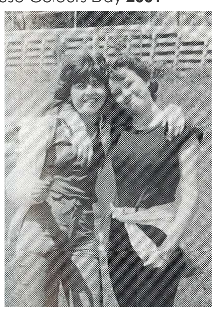
School Life 1983