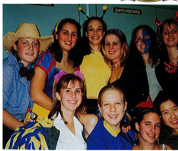
VCE Fancy Dress Ball 2001