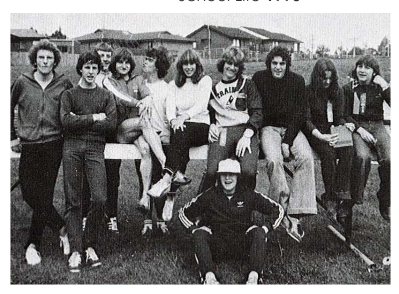
Year 12 1978