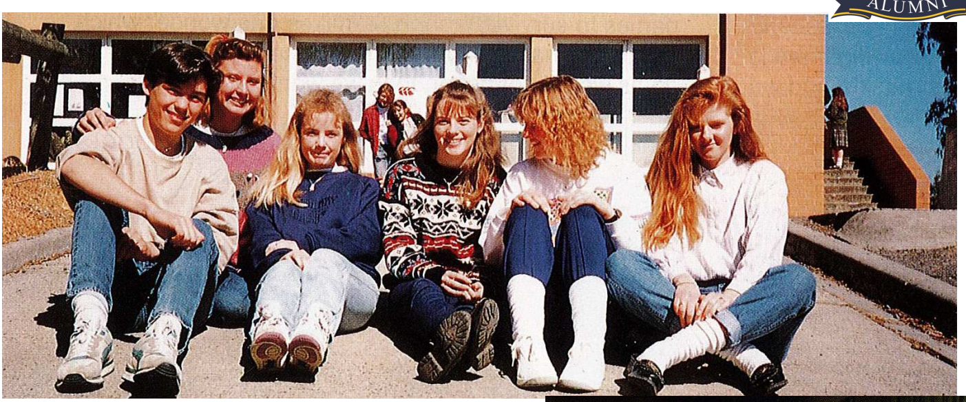
School Life 1990