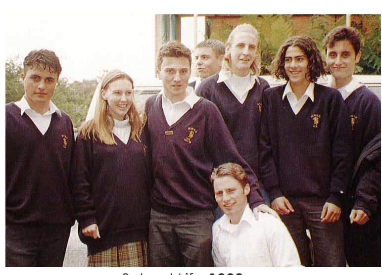
School Life 1993