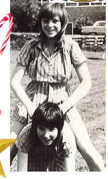
School Life 1973