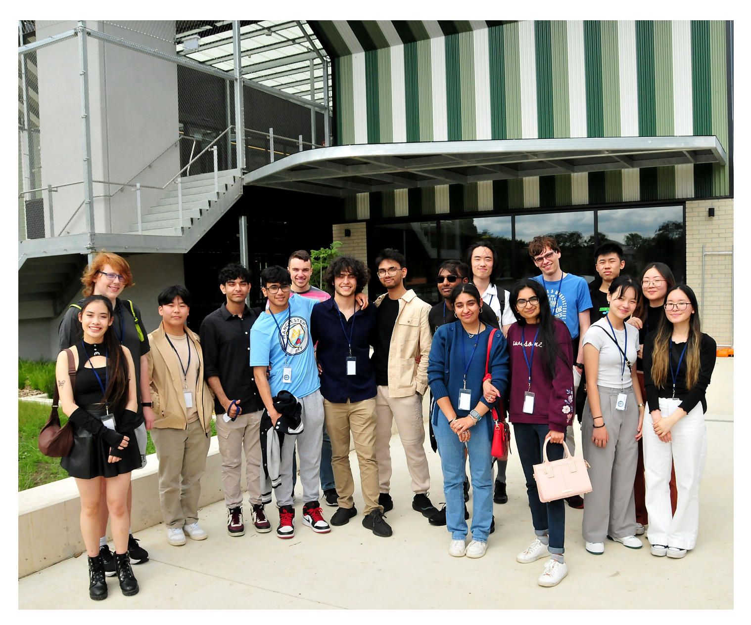
Class of 2022 outside MWSC's new STEAM Centre

A big thank you to the Class of 2022! It was wonderful to catch up with some of our freshest Alumni and find out how their first post-schooling year has been. Look out for their stories in future Alumni newsletters.