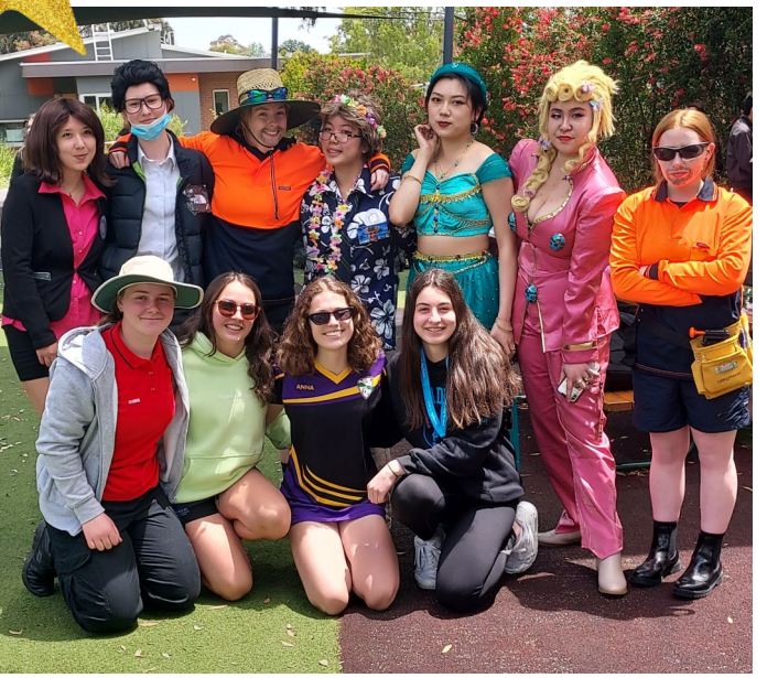
Fancy Dress 2021

Page 6 Alumni Monthly Newsletter Issue 11 - December 2023