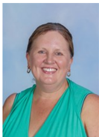
Careers Practitioner & VET Coordinator