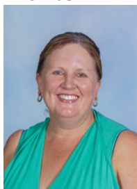
Careers Practitioner & VET Coordinator