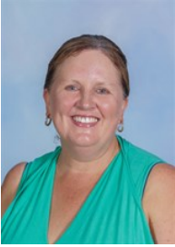
Careers Practitioner & VET Coordinator