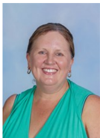
Careers Practitioner & VET Coordinator