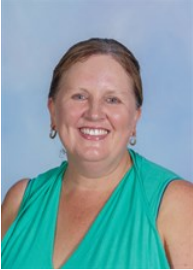
Careers Practitioner & VET Coordinator