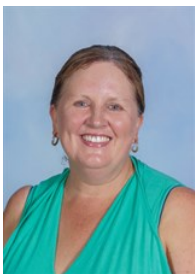
Careers Practitioner & VET Coordinator